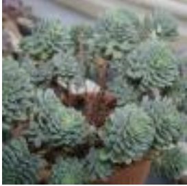
Evergreen - whole plant - Late Autumn