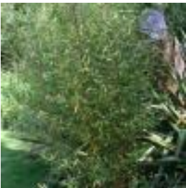
Other - whole plant