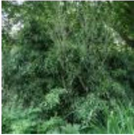
Other - whole plant