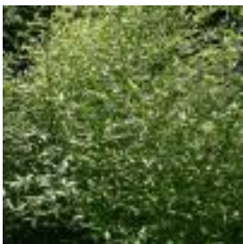
Other - whole plant