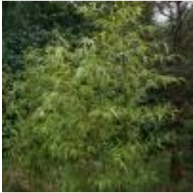
Other - whole plant - Late Spring